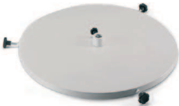
COPRIFUSTO / DRUM COVER

11330 Coprifusto diametro 330 mm bocchettone diametro 28 mm per fusti 20/30 kg. Drum cover diameter 330 mm (13,00 in) central hole diameter 28 mm (1,10 in) for drums 20/30 kg. (44/66 lb)