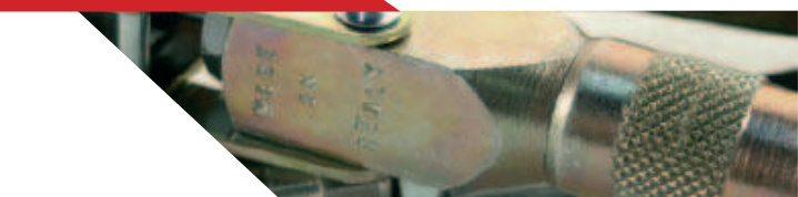
MEMBRANA / FOLLOWER PLATE

11360 Coprifusto diametro 600 mm bocchettone diametro 28 mm per fusti 200 kg. Drum cover diameter 600 mm (23,62 in) central hole diameter 28 mm (1,10 in) for drums 200 kg. (441,00 lb)