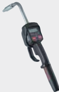
EM5™ Electronic Oil Meter