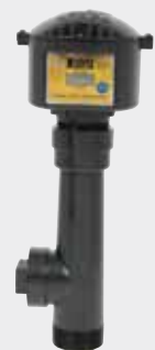
Tank Level Monitor