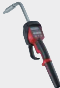
PM5™ Pre-Set Electronic Oil Meter